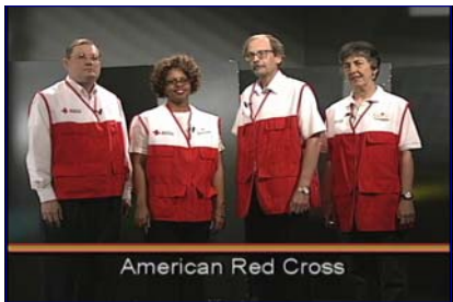
American Red Cross

Houston Association of Volunteer Administrators (HAVA) & Houston MediaSource would like to thank the following organizations for participating in 'Get the Word Out' on April 19, 2005. The PSAs taped will air on Houston MediaSource (cable channels: Time Warner 17, TV Max 95 and Kingwood 98) on Friday, May 05, 2005 at the following times: 8 a.m., 2 p.m., & 10 p.m. The PSAs will also be used to fill empty time slots on the channel.