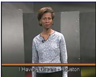
I Have A Dream - Houston