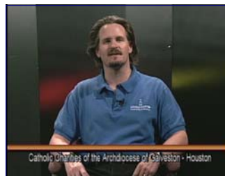
Catholic Charities of the Archdiocese of Galveston - Houston