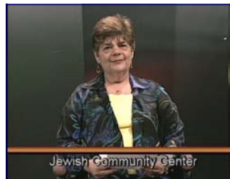
Jewish Community Center