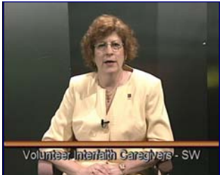
Volunteer Interfaith Caregivers - SW

Houston Association of Volunteer Administrators (HAVA) & Houston MediaSource would like to thank the following organizations for participating in 'Get the Word Out' on April 19, 2005. The PSAs taped will air on Houston MediaSource (cable channels: Time Warner 17, TV Max 95 and Kingwood 98) on Friday, May 05, 2005 at the following times: 8 a.m., 2 p.m., & 10 p.m. The PSAs will also be used to fill empty time slots on the channel.