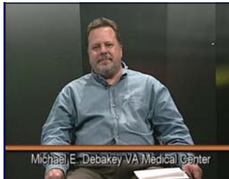
Michael E. DeBakey VA Medical Center