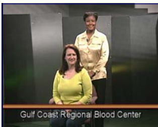
Gulf Coast Regional Blood Center