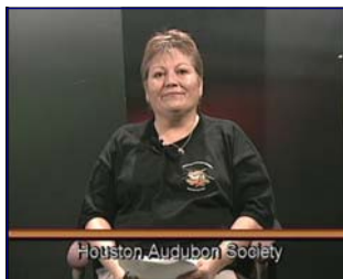
Houston Audubon Society