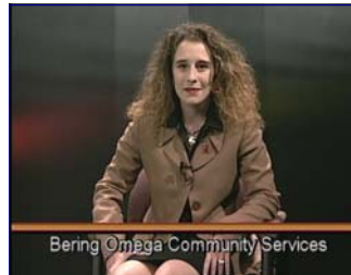
Bering Omega Community Services