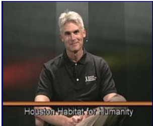
Houston Habitat for Humanity