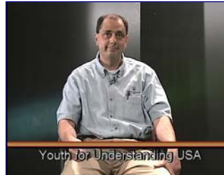
Youth for Understanding USA