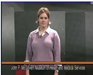
John P. McGovern Museum of Health and Medical Services